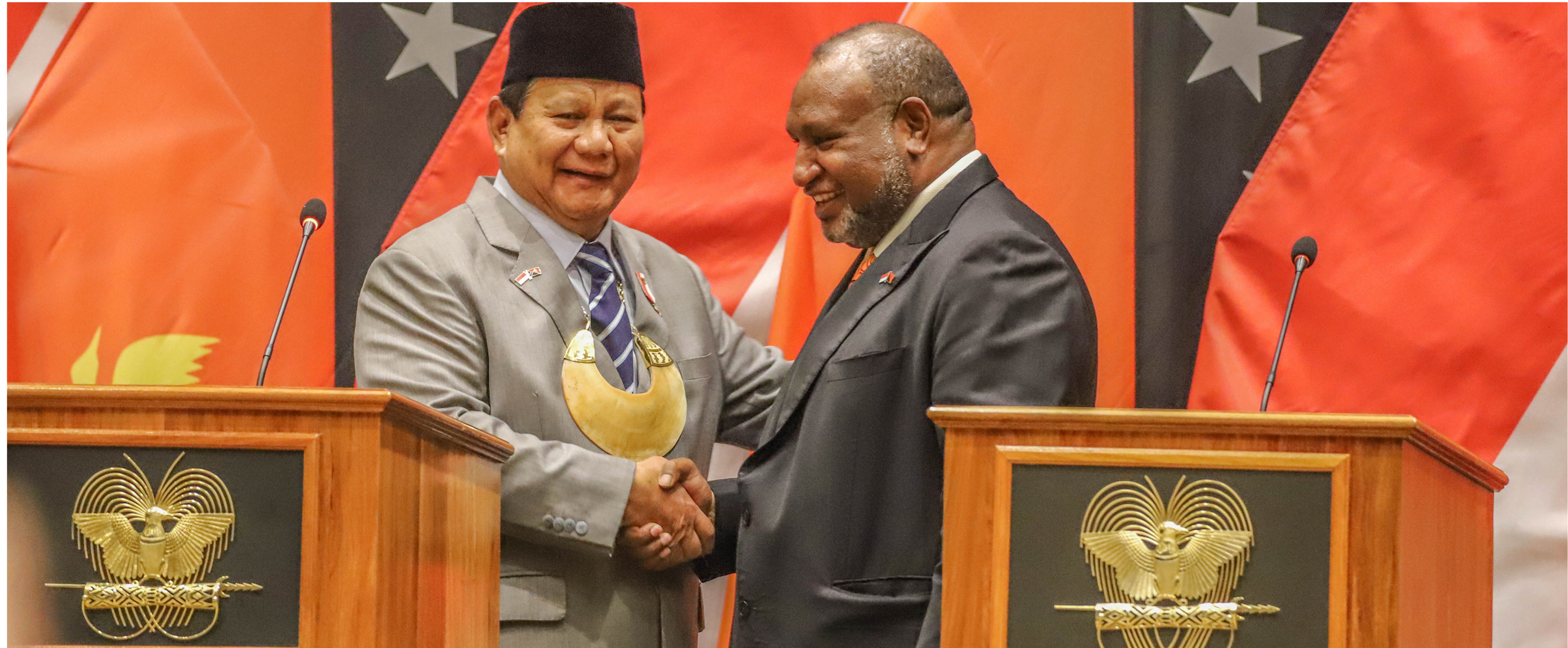
Prime Minister Hon. James Marape (right) with President-Elect of the Republic of Indonesia, His Excellency Prabowo Subianto, at their joint press conference, Stanley Hotel, Port Moresby, on Wednesday 21 August 2024.

The President-Elect of the Republic of Indonesia, His Excellency Prabowo Subianto, made an official visit to Papua New Guinea this month , and was warmly received by Prime Minister Hon. James Marape. The two leaders held a press conference at the Stanley Hotel in Port Moresby, marking a significant step in the bilateral relations between the two neighboring countries. Prime Minister Marape highlighted the importance of the meeting, emphasizing the strong foundational ties between Papua New Guinea and Indonesia. "Today we concluded a very good