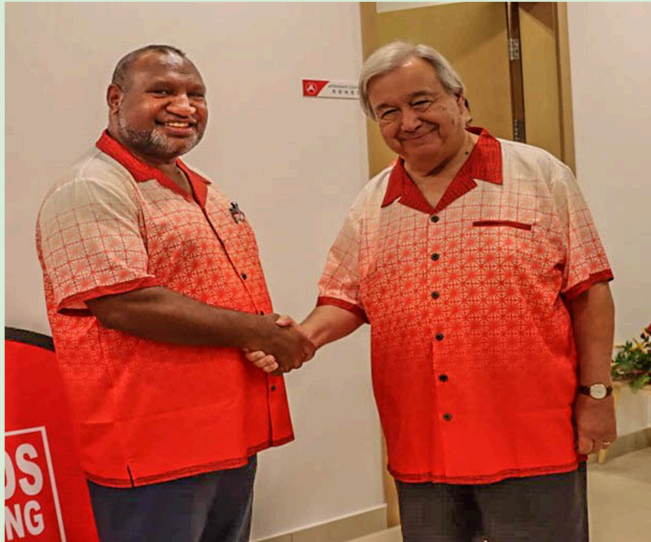
Prime Minister James Marape (left) meeting with the United Nations Secretary-General H.E. Antonio Guterres, on the margins of the 53rd Pacific Islands Forum Leaders' summit in Tonga. (photo credit: PM&NEC Media).

Prime Minister Hon. James Marape met with the Secretary-General of the United Nations, His Excellency Antonio Guterres, on the margins of the 53rd Pacific Islands Forum (PIF) Leaders' meeting in Tonga, where they discussed issues on continued fight against climate change impact,