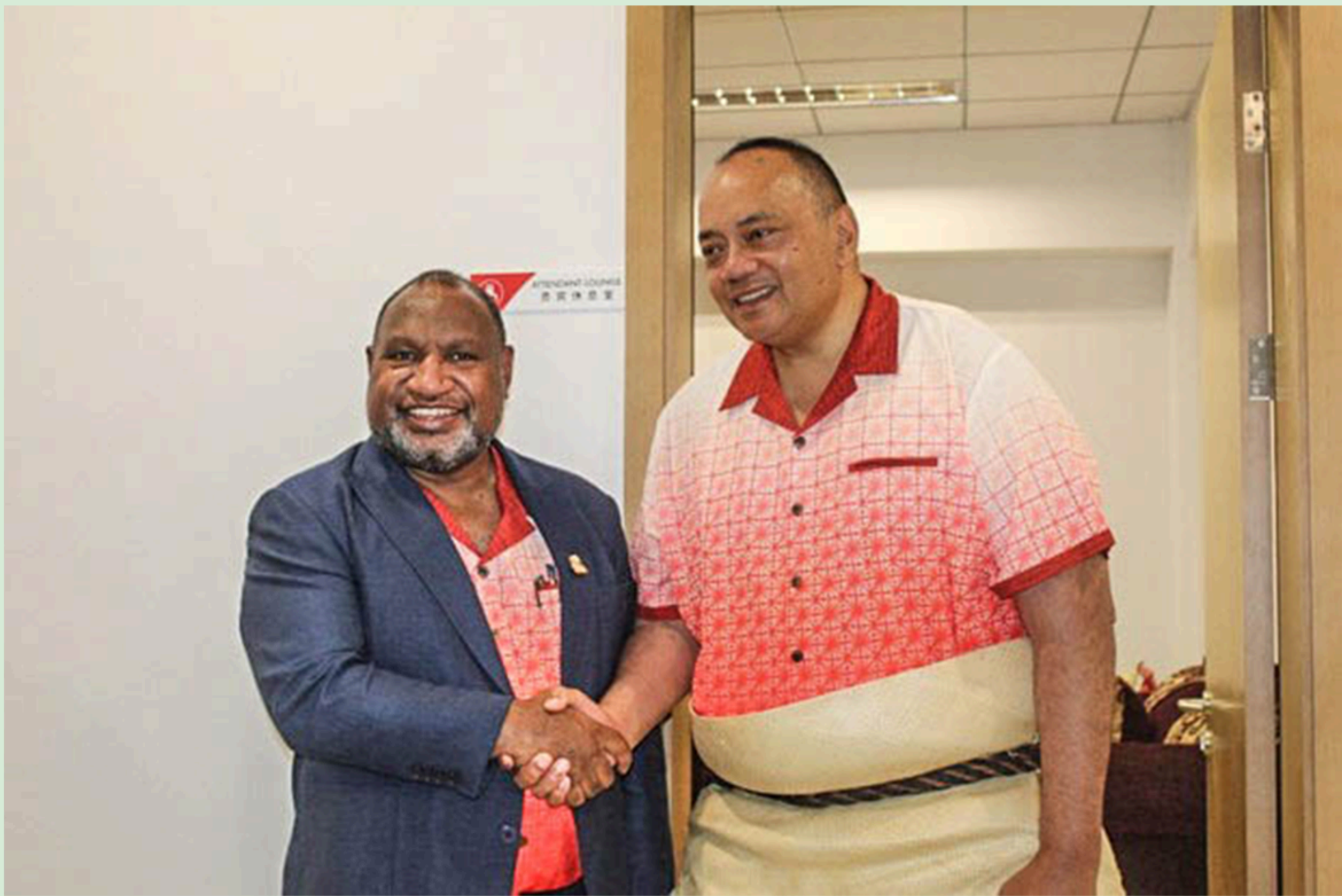
Prime Minister Hon. James Marape (left) paying a courtesy visit to Prime Minister Solaveni of Tonga, (picture credit: PM's Media)

Prime Minister Marape also commended Australia for its recognition of the 2050 Strategy for