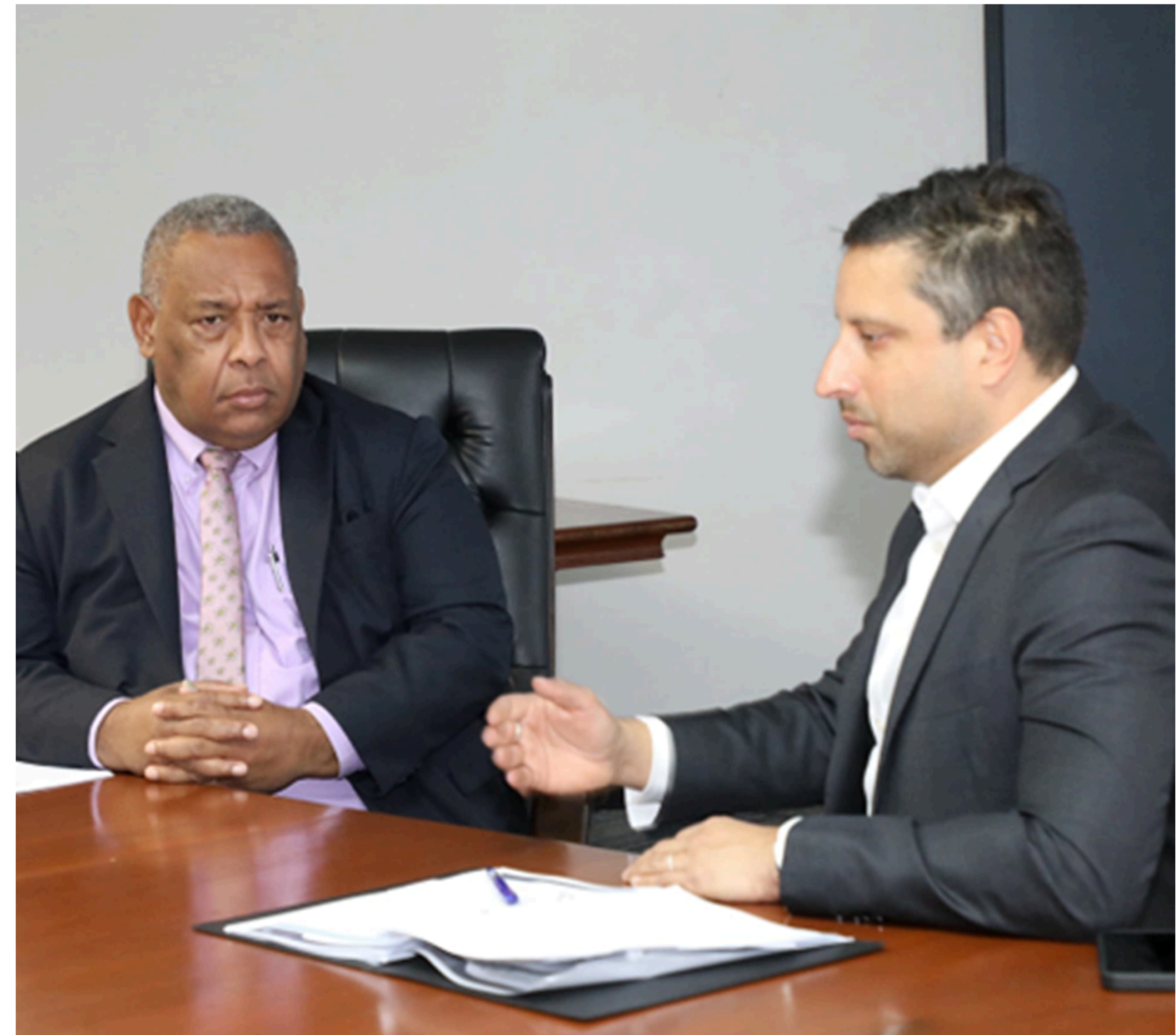
Chief Secretary Ivan Pomaleu in a meeting with Australia's Cyber Ambassador, Branden Dowling (right). (picture credit: PM&NEC Media Unit).

red rash that progresses to fluid-filled blisters. The Department stresses the importance of staying informed through official government channels and avoiding the spread of rumors. Reporting any suspected cases to the nearest health center as soon as possible is crucial for controlling the spread of the virus. The current situation calls for vigilance and cooperation from everyone in Papua New Guinea. He emphasised that the country can reduce the risks associated with Mpox and other infectious diseases by following the recommended guidelines and supporting each other.