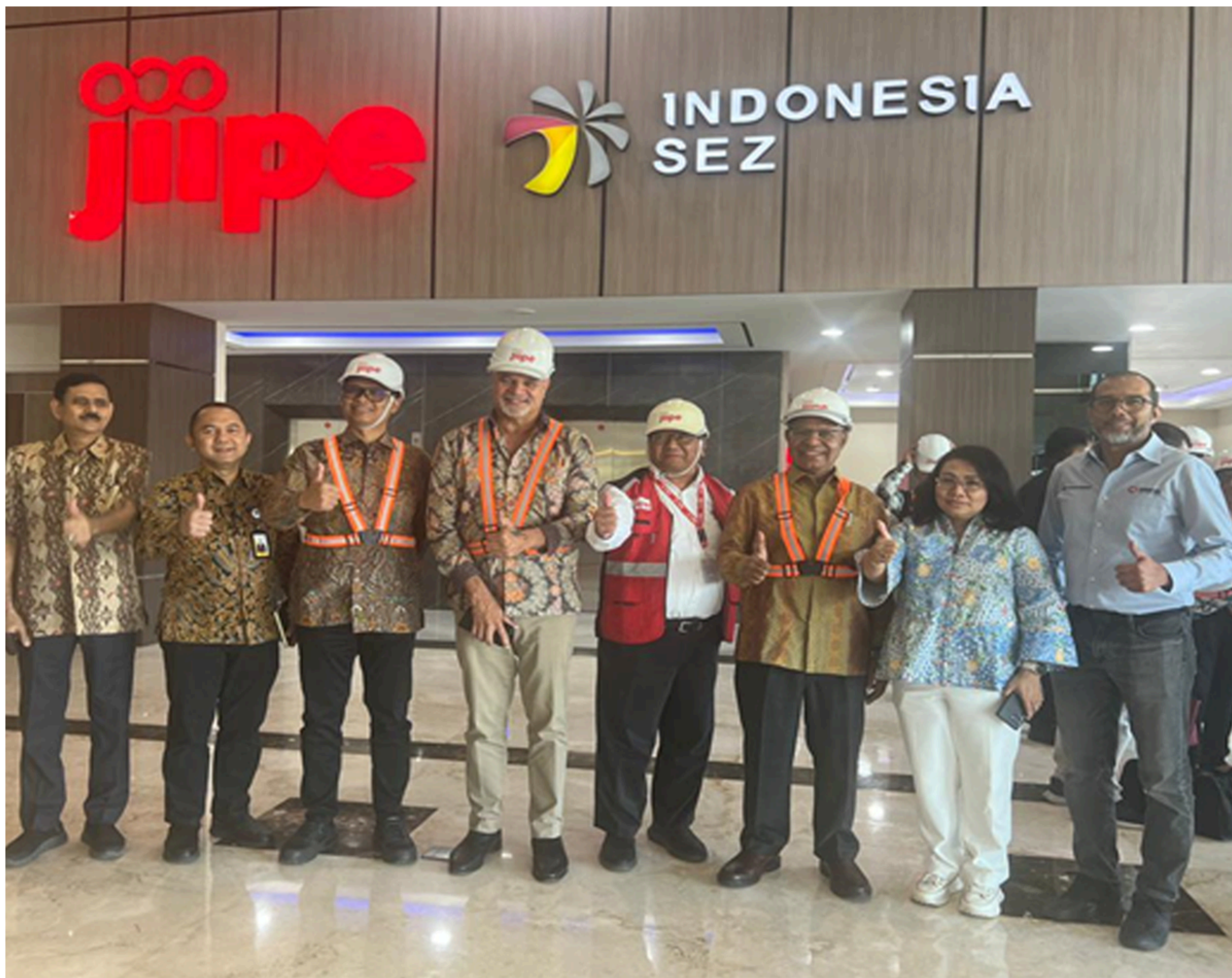
Deputy Prime Minister Hon. John Rosso and International Trade and Investments Minister Hon. Richard Maru with Indonesian SEZ officials.