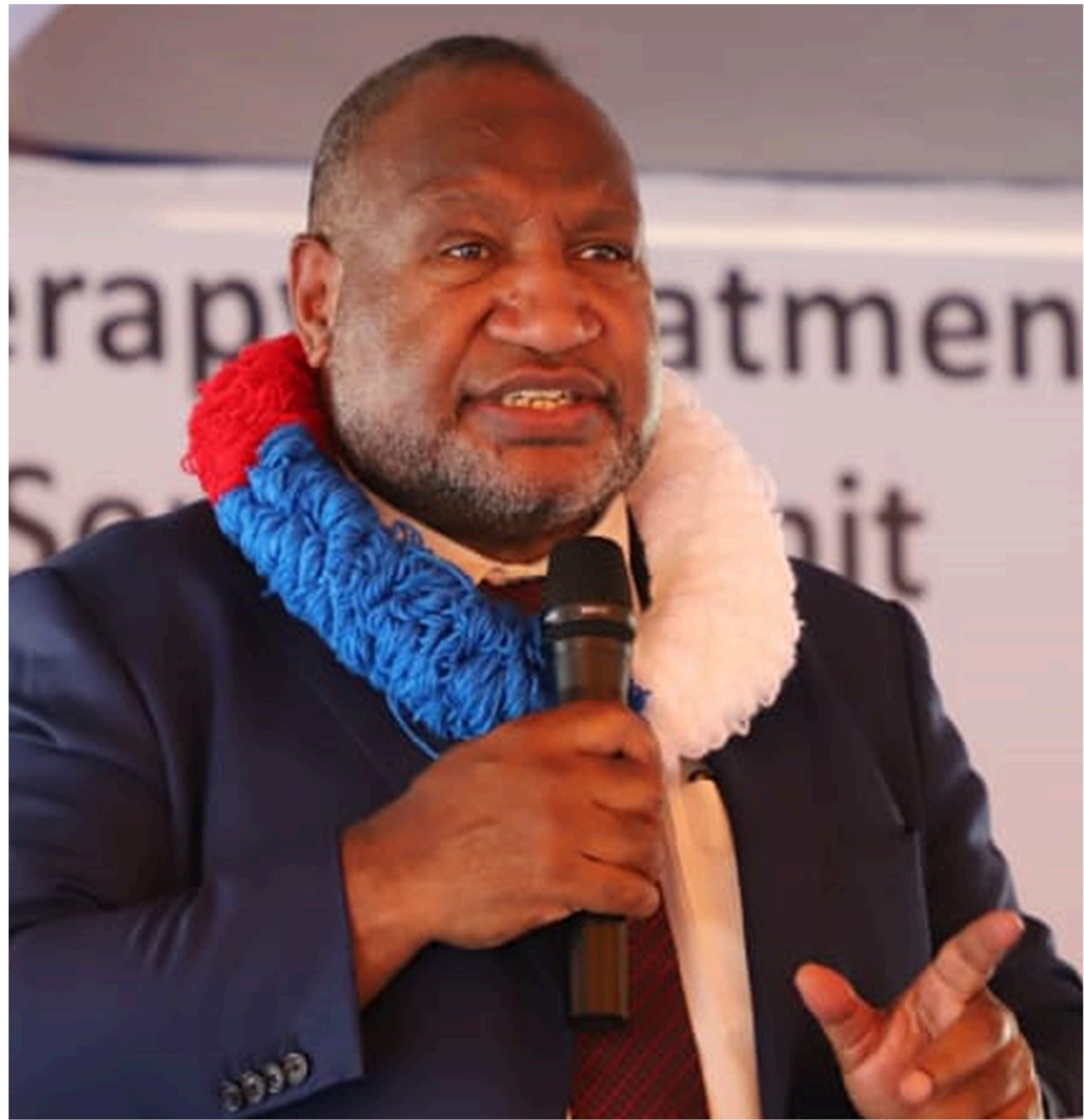
Prime Minister James Marape re-opening the Radiotherapy Treatment Facility at ANGAU Memorial Hospital in Lae.