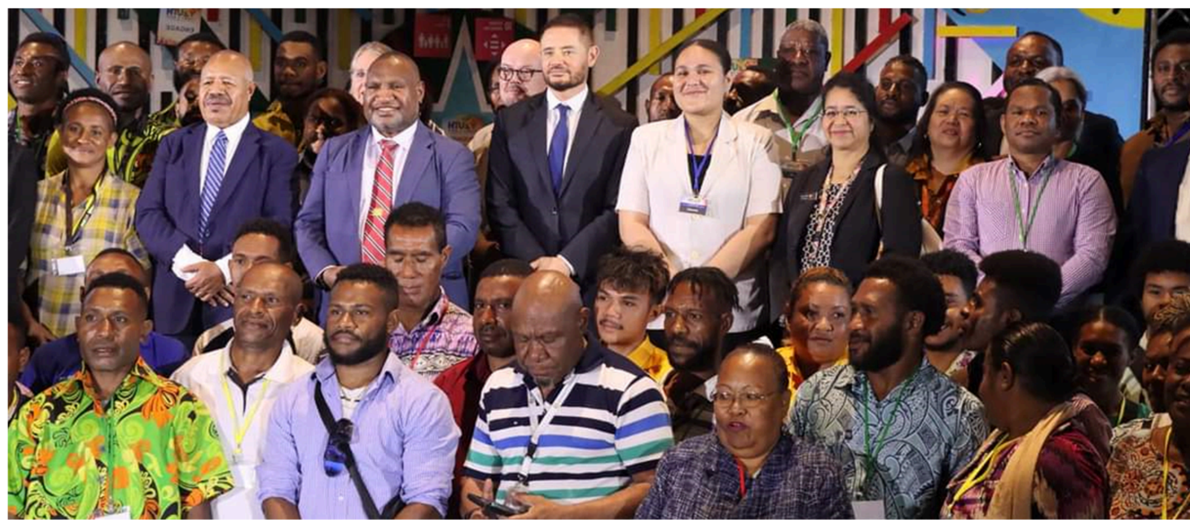
Prime Minister James Marape launching the 1st inaugural NCD Youth Summit & Expo at Apec Haus. The event coincided with the World Youth Day celebrated on 12th August.

“We all know very much, that the only people that can help solve these challenges of young people, are young themselves,” Mr Howard said.