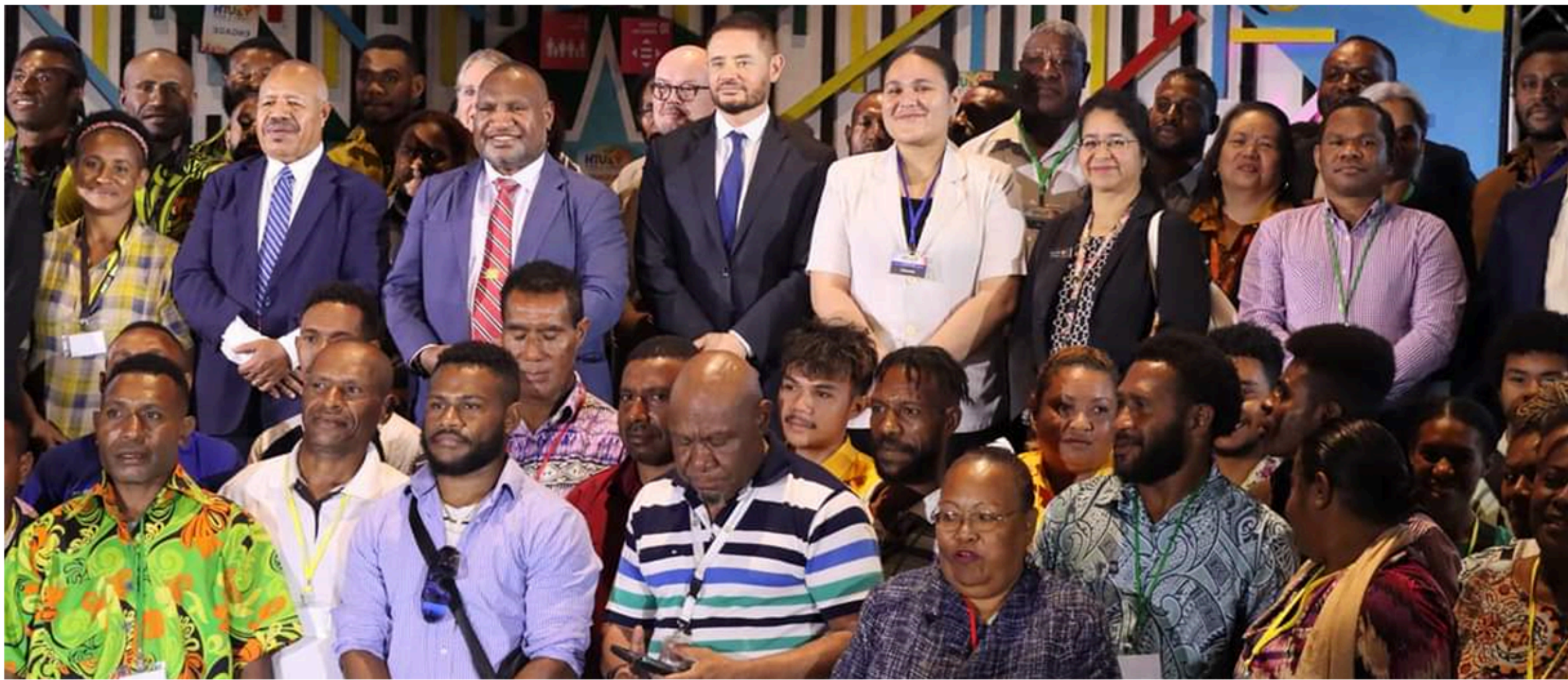
Prime Minister James Marape launching the 1st inaugural NCD Youth Summit & Expo at Apec Haus. The event coincided with the World Youth Day celebrated on 12th August.

“We all know very much, that the only people that can help solve these challenges of young people, are young themselves,” Mr Howard said.