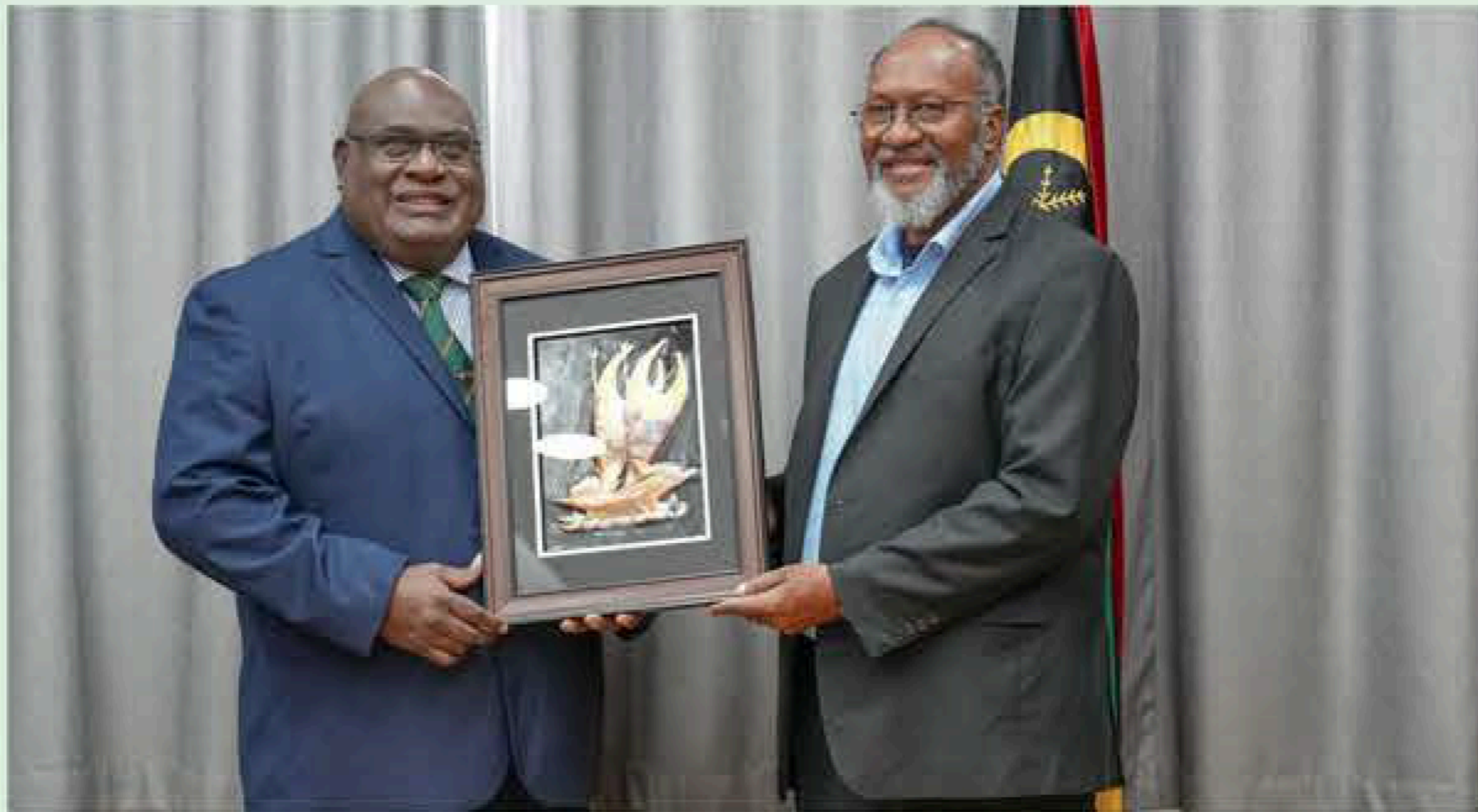
Prime Minister Hon. James Marape (right) with President-Elect of the Republic of Indonesia, His Excellency Prabowo Subianto, at their joint press conference, Stanley Hotel, Port Moresby, on Wednesday 21 August 2024.

Prime Minister Tabimamas expressed his gratitude to Minister Masiu for highlighting the critical role of ICT in enhancing connectivity and resilience across the Pacific islands, during his visit.