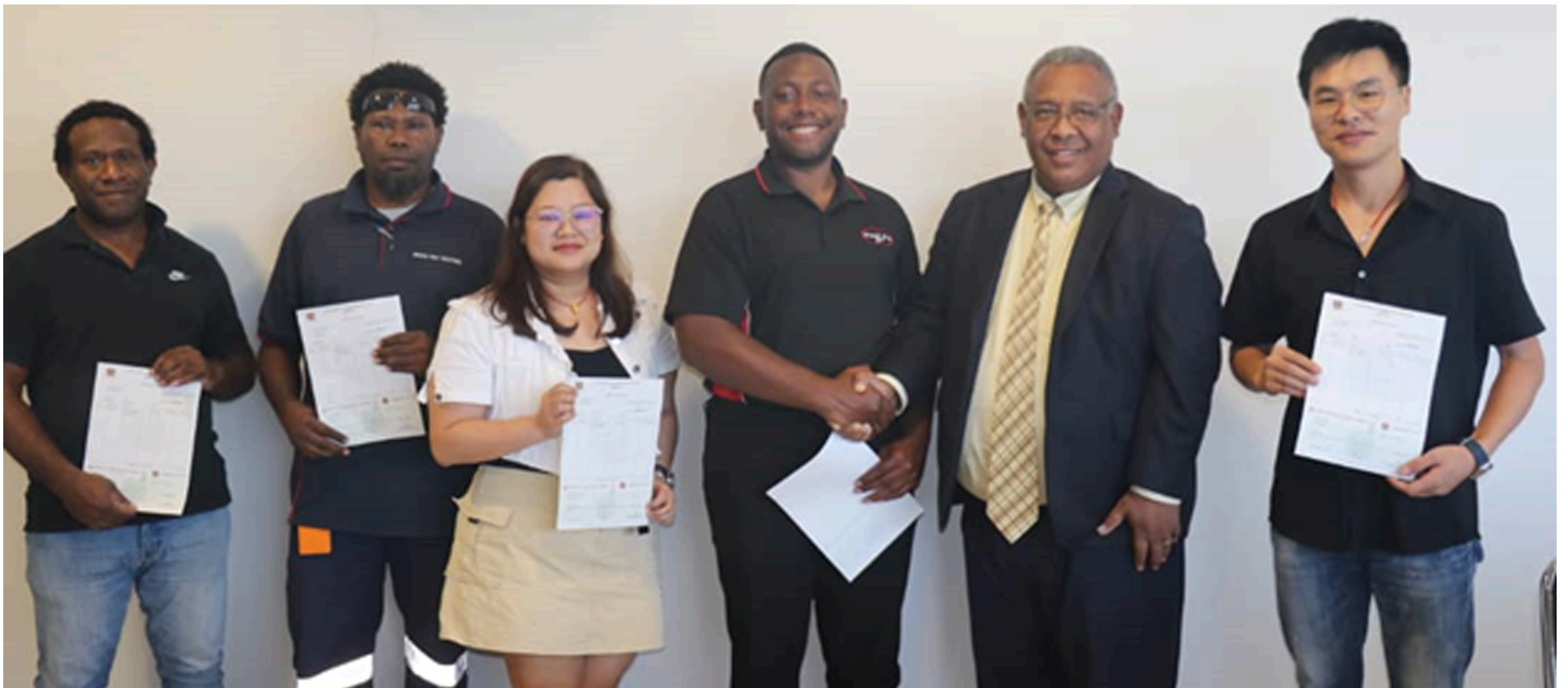
Prime Minister Hon. James Marape (right) with President-Elect of the Republic of Indonesia, His Excellency Prabowo Subianto, at their joint press conference, Stanley Hotel, Port Moresby, on Wednesday 21 August 2024.

The National Government, in its restoration efforts, continues to assist companies restore their businesses destroyed in the January 10 riots, caused by police withdrawal of services over salary issues.