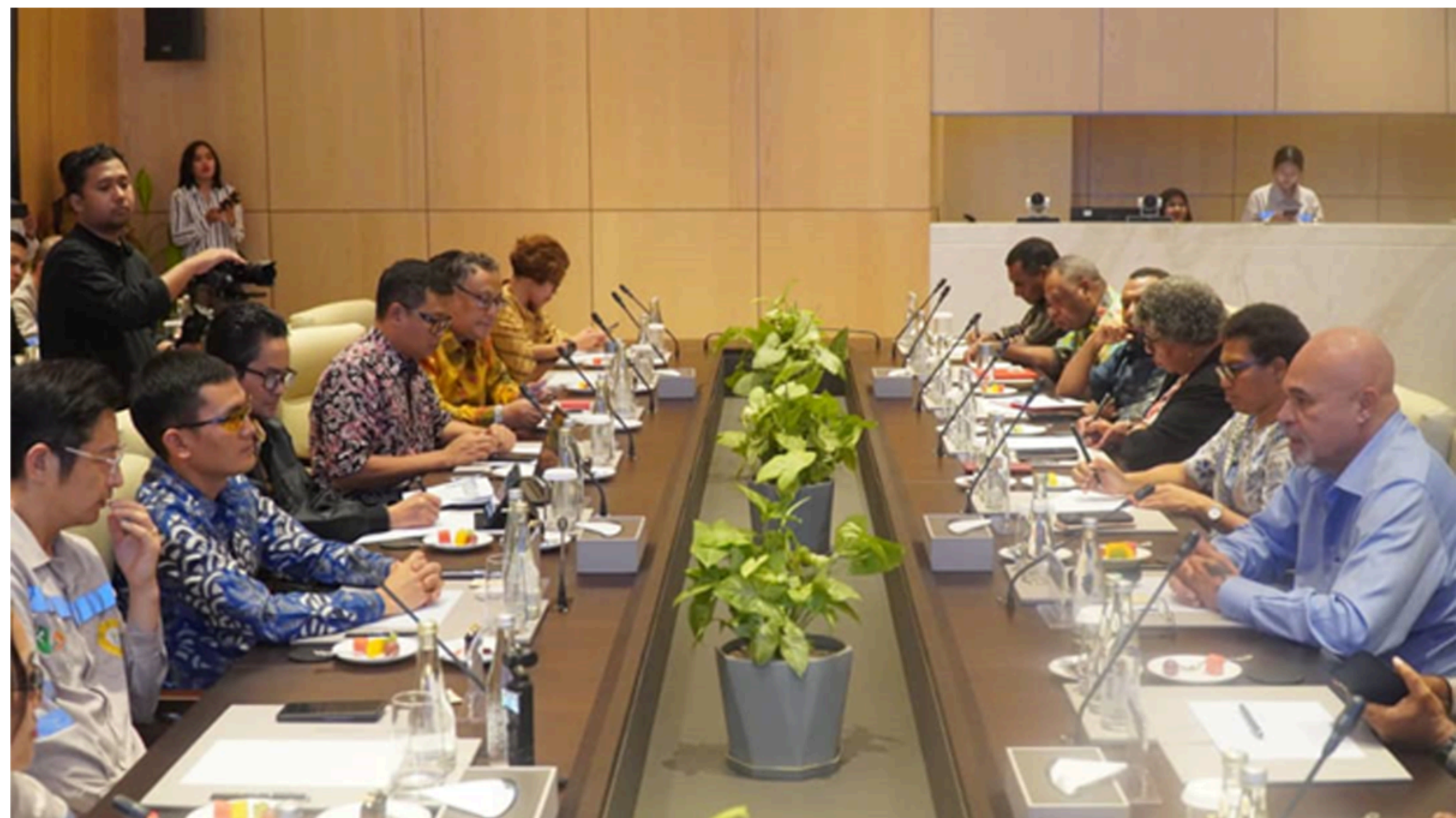
Prime Minister Hon. James Marape (right) with President-Elect of the Republic of Indonesia, His Excellency Prabowo Subianto, at their joint press conference, Stanley Hotel, Port Moresby, on Wednesday 21 August 2024.

Deputy Prime Minister and Minister for Lands, Physical Planning and Immigration, Hon. John Rosso, has expressed his confidence that Papua New Guinea can greatly benefit from Indonesia's expertise in utilising its vast natural resources.