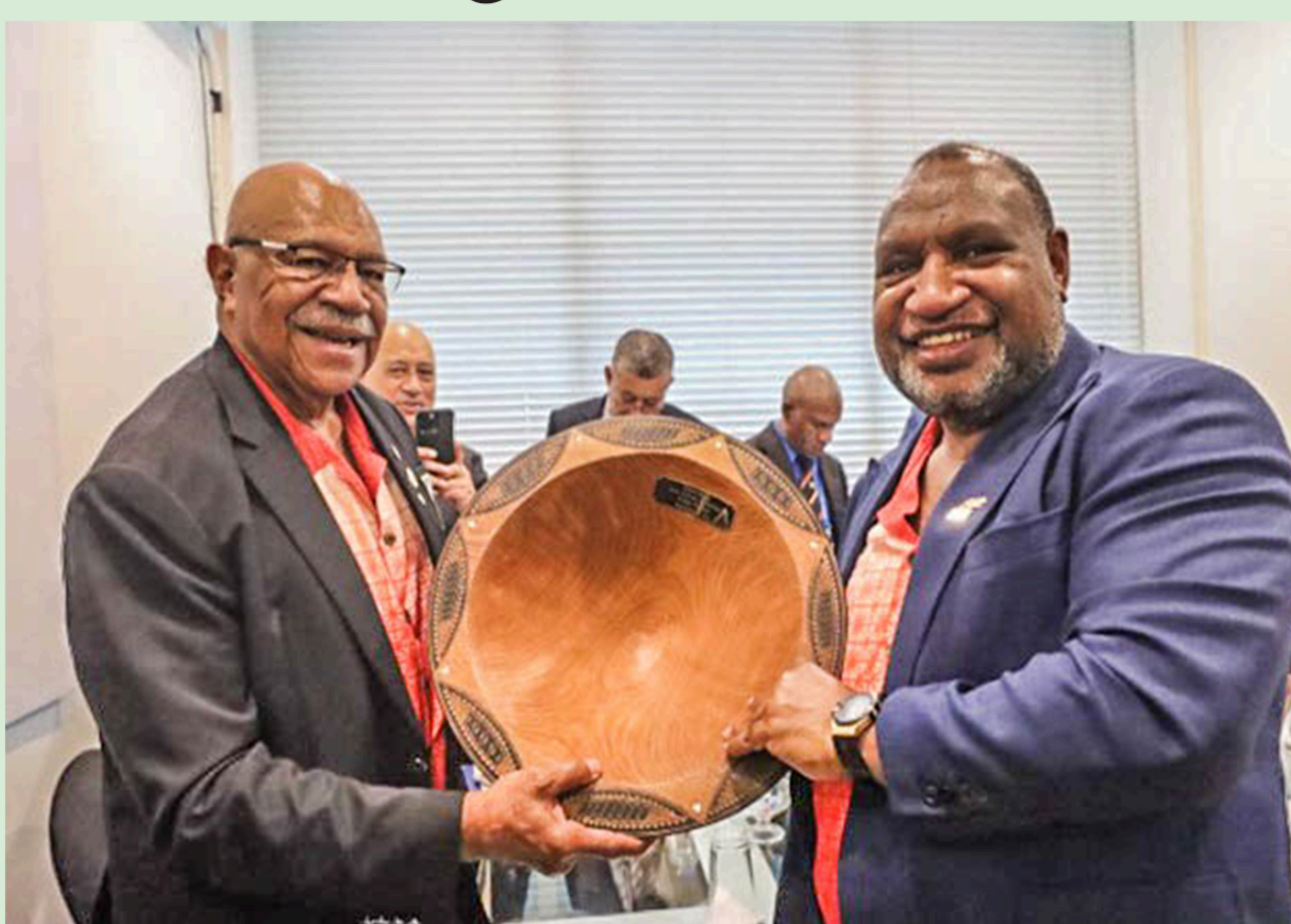
Fiji's Prime Minister, Sitiveni Rabuka (left) presenting a Fijian traditional gift to Prime Minister James Marape at their bilateral meeting, held on the sidelines of the PIF Leaders' summit in Nuku'alofa, Tonga, on Monday, 26 August 2024. (photo courtesy: PM's Media).

Prime Minister Marape also made known the availability of land to Prime Minister Rabuka for the construction of the Fiji mission building in Port Moresby, committing K25 million to commence construction.