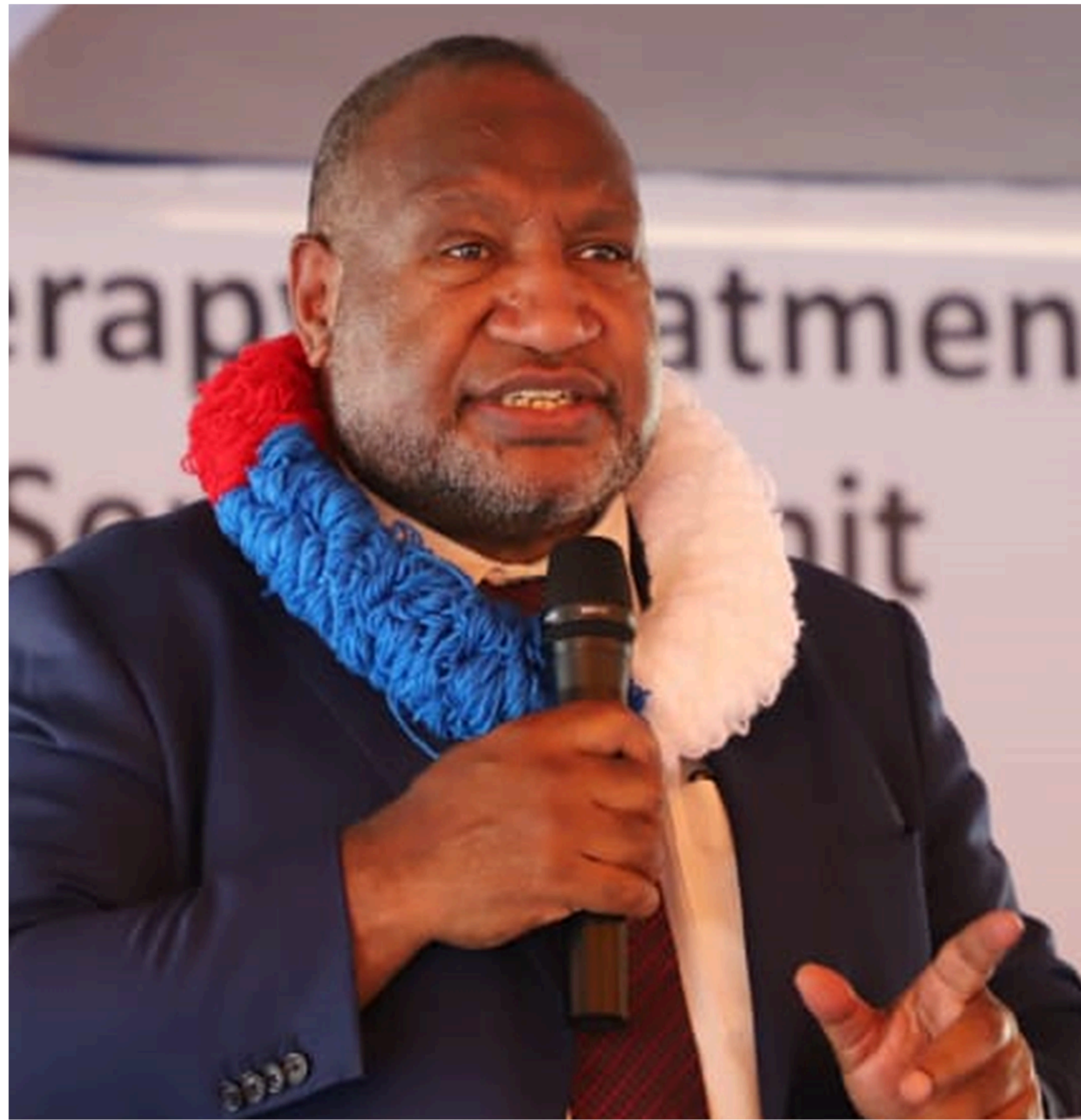
Prime Minister James Marape re-opening the Radiotherapy Treatment Facility at ANGAU Memorial Hospital in Lae.