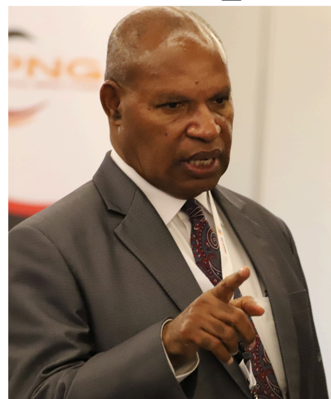
Minister for International Trade and Investment Hon. Richard Maru

The National Executive Council (NEC) recently approved, in principle, the development of the Pacific Marine Industrial Zone (PMIZ) in Madang Province. The Minister for International Trade and Investment, Hon. Richard Maru in announcing the decision, said the PMIZ would be developed in two phases.