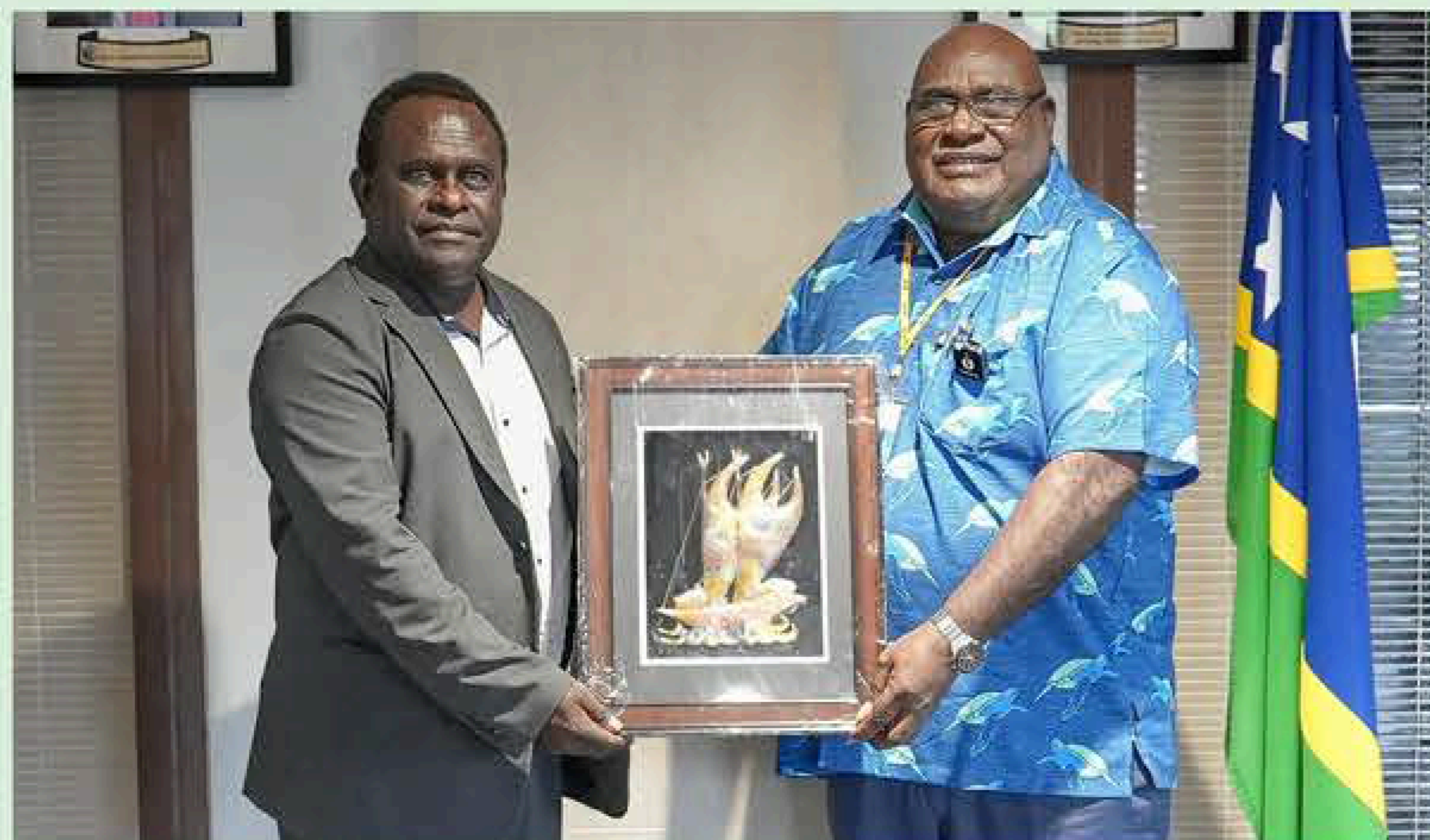
Minister for Information and Communications Technology, Hon Timothy Masiu (right), presenting a gift to Solomon Islands Minister for Communication, Hon. Fredrick Kologeta.

Papua New Guinea's Minister for Information and Communications Technology (ICT), Hon. Timothy Masiu, successfully forged stronger ties with Solomon Islands in areas of information and communications technology.